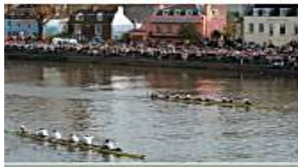
Boat racing on the Thames