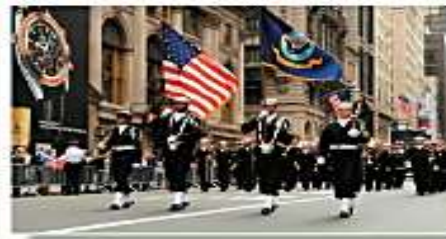
Columbus Day parade