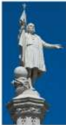
Monument to Christopher Columbus

Complete these texts about US holidays using the appropriate forms of the words on the right.